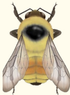
Red-belted bumble bee Bombus rufocinctus