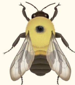
Brown-belted bumble bee Bombus griseocolis