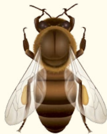
European Honey bee

Do not be scared of being stung! Only female bees can sting and many solitary bees are unable to sting. You can observe bees without fear as long as you don't disturb them or their nest. Generally, if you leave them alone, they will leave you alone.