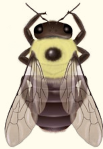
Large carpenter bee