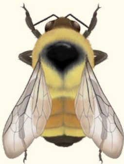
Tri-coloured bumble bee Bombus ternarius