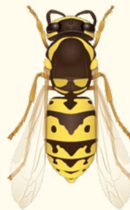
Yellow jacket (wasp)