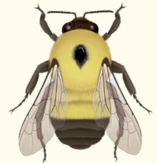
Half-black bumble bee Bombus vagans